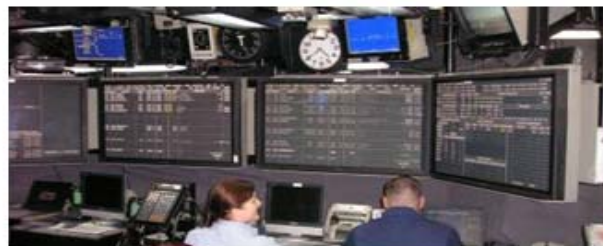
Aviation Management Info Systems