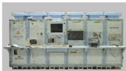
Automated Test Equipment