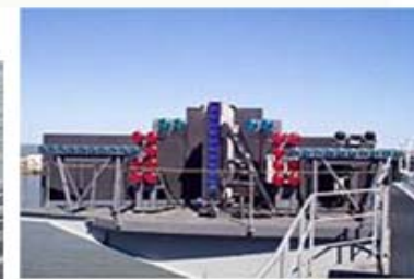
Visual Landing Aids